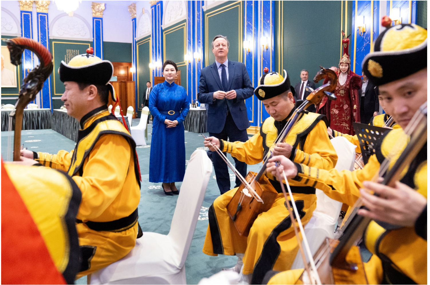
Lord Cameron of Chipping Norton, the foreign secretary, met the Mongolian foreign minister, Batmunkh Battsetseg, in the capital, Ulaanbaatar, during a five-day tour of central Asia