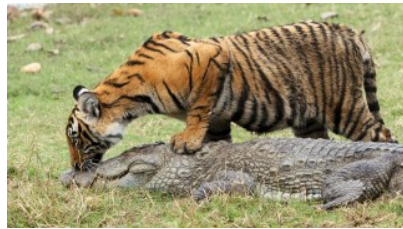
PHOTOGRAPHY News in pictures April 25 2024, 12.01am The Times