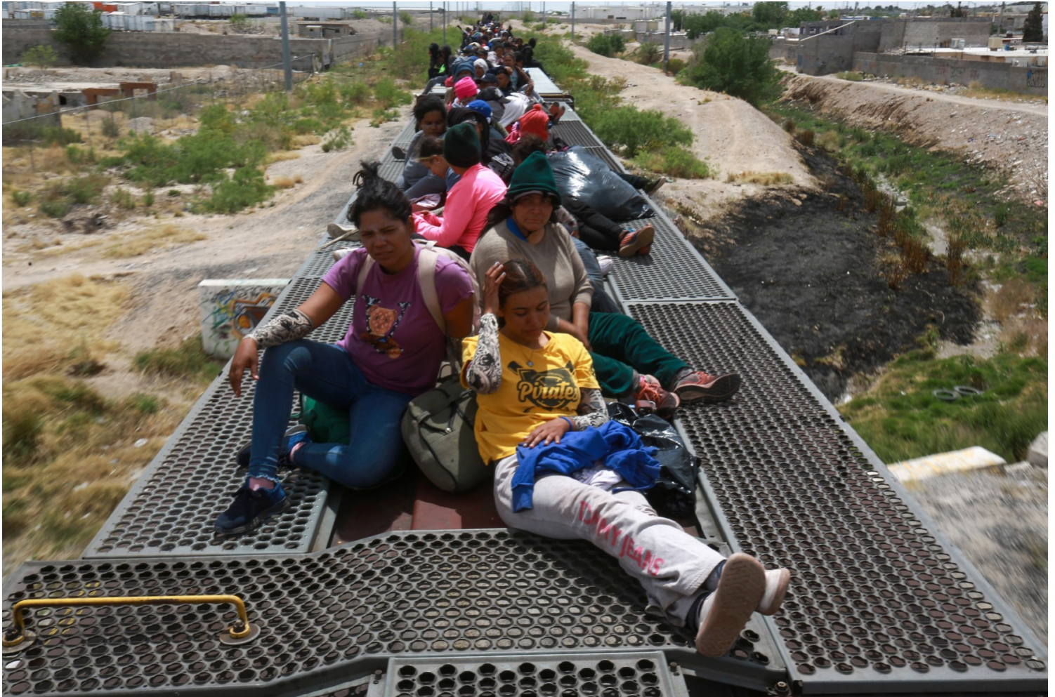
Thousands of migrants arrive at Ciudad Juarez in Mexico aboard a train from Chihuahua, to try to cross the border with the US. There has been a surge in migrants during the past few days