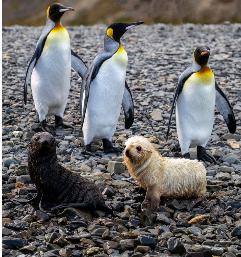
A rare leucistic seal pup, next to a guard of emperor penguins on the beach at Stromness, South Georgia, in the South Atlantic, has been accepted by the more conventionally coloured seals in its pod