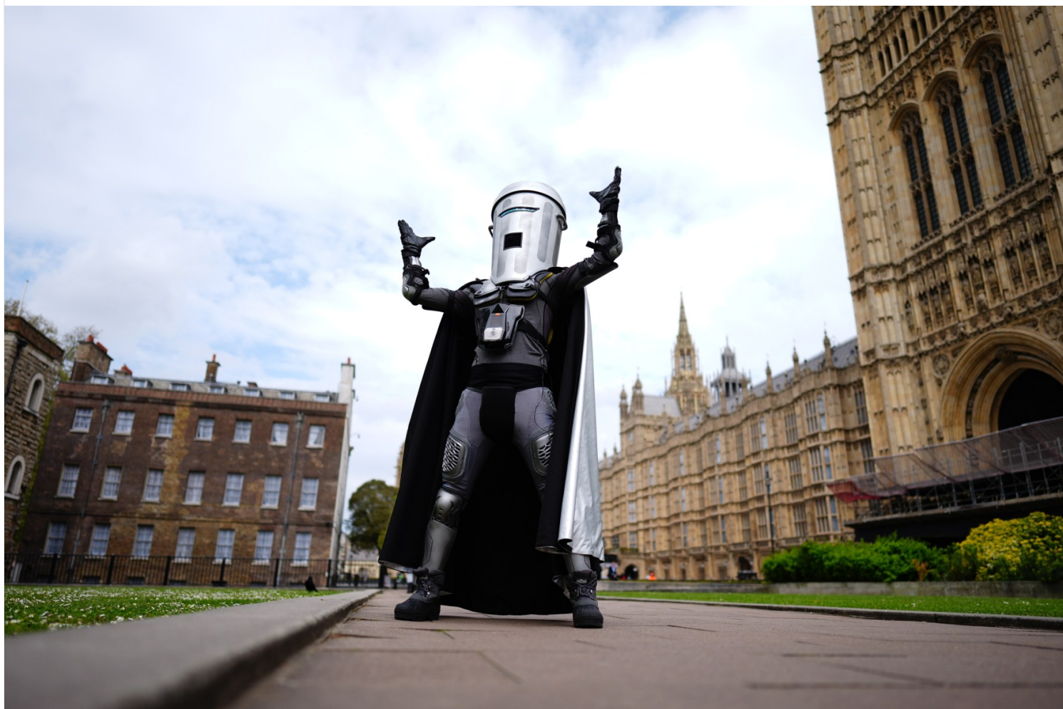
Count Binface, a satirical political candidate in the London mayoral election on May 2, makes a stand on College Green, outside parliament