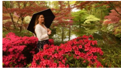
News in pictures April 23 2024, 11.00pm